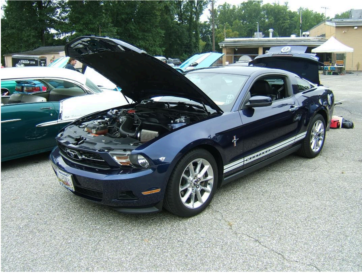
My '11 V6 coupe