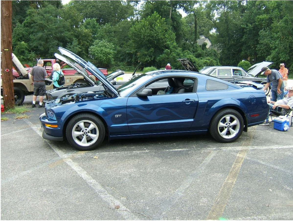
Glenn's '08 GT coupe

But then I checked the forecast first thing and found that there was no rain for that morning, and the thunderstorms would not roll in until after 1pm. Maybe if the Knights put their vote tabulating on speed dial we could get most of the show completed in dry weather. But before I pulled my Mustang out of the garage at 9am, the storm prediction was now moved to 3pm. Life was good! So I kicked myself a few times to get my head in the game once I realized that maybe, just maybe, this was going to be an okay show day!