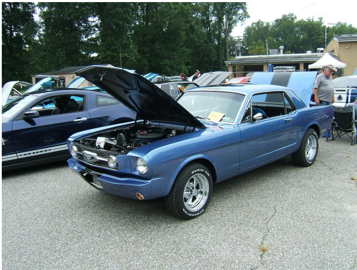
John's '66 GT coupe

The weather, though, did somewhat limit the attendance for this excellent event. Typically there were usually about 70-80 cars, trucks and motorcycles on site, but today we only reached about half of that with possibly 40 entries. This was good news for the entrants, but not helpful at all for the Knights of Columbus. Because all of the awards were donated, all of their entry fees were available for other charitable causes that the Knights supported. Unfortunately, they lost about half of their revenue because so many people stayed home.