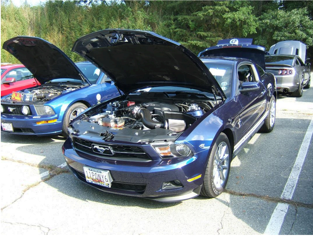
My Mustang before the soda can incident!

I finally left the Knights not long after. On the way home while driving on I-95, the right side of my windshield got rocked when I heard that awful, distinctive 'crack!' sound. I could not see exactly where it hit until I got home. Fortunately, this was a small area that I filled with resin from a glass repair kit. At the same time I was out in my driveway with a bucket of water and a sponge cleaning the remaining soda out of my console! About an hour later I had both problems resolved, so fortunately this odd little story ended well.