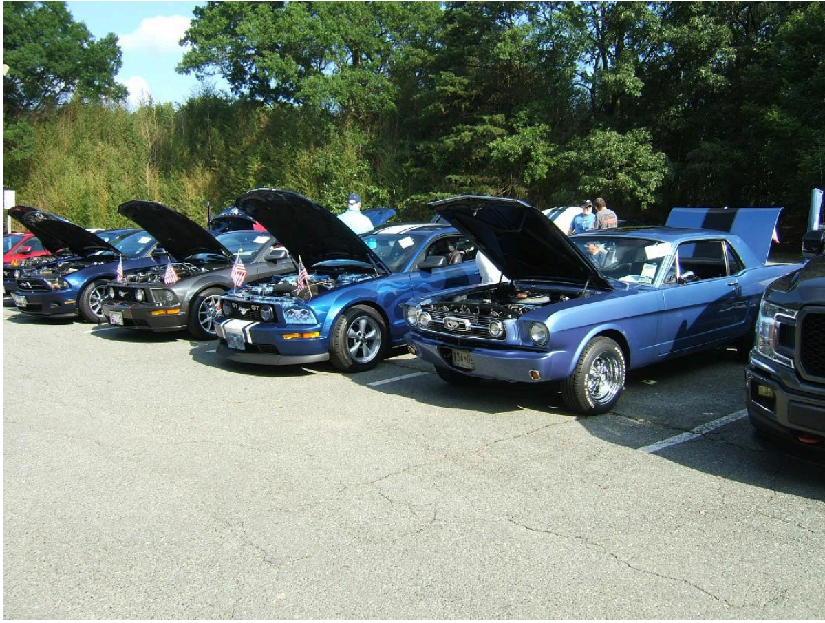
Our four traveling Mustangs!

But later things got a little strange for my Mustang and me. I said good-bye to my friends and packed my gear. I next pulled a cold Pepsi can out of a cold pack in my trunk. It slipped from my hand, hit my rear bumper and fell on the macadam. The can looked alright, and so I put it in the cup holder in my console. I then made a big mistake and tried to pop the top open too soon, and the agitated soda erupted and shot out all over my console and down the side of my car seat. I quickly pulled the Pepsi out of my car and dropped it on the ground, and the soda ran down the parking lot. I grabbed my paper towels and Windex and started cleaning that mess out of my console!